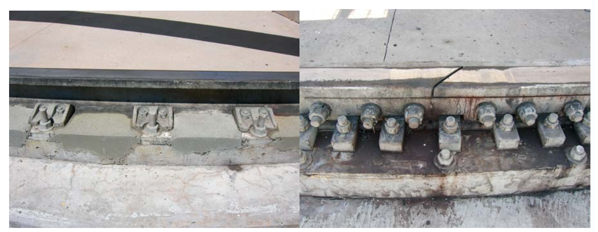
The Los Alamos rail is in good condition.