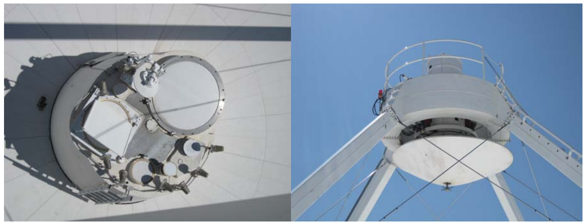
The feed heaters and FE windows are in good condition. Apex paint is in good condition.