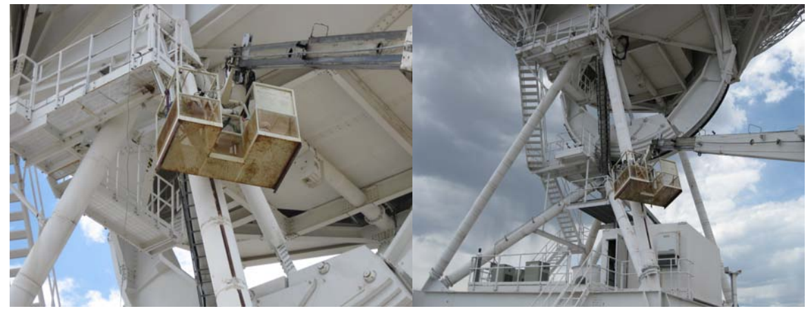
The antenna leg insulation was reattached and banded in several locations.