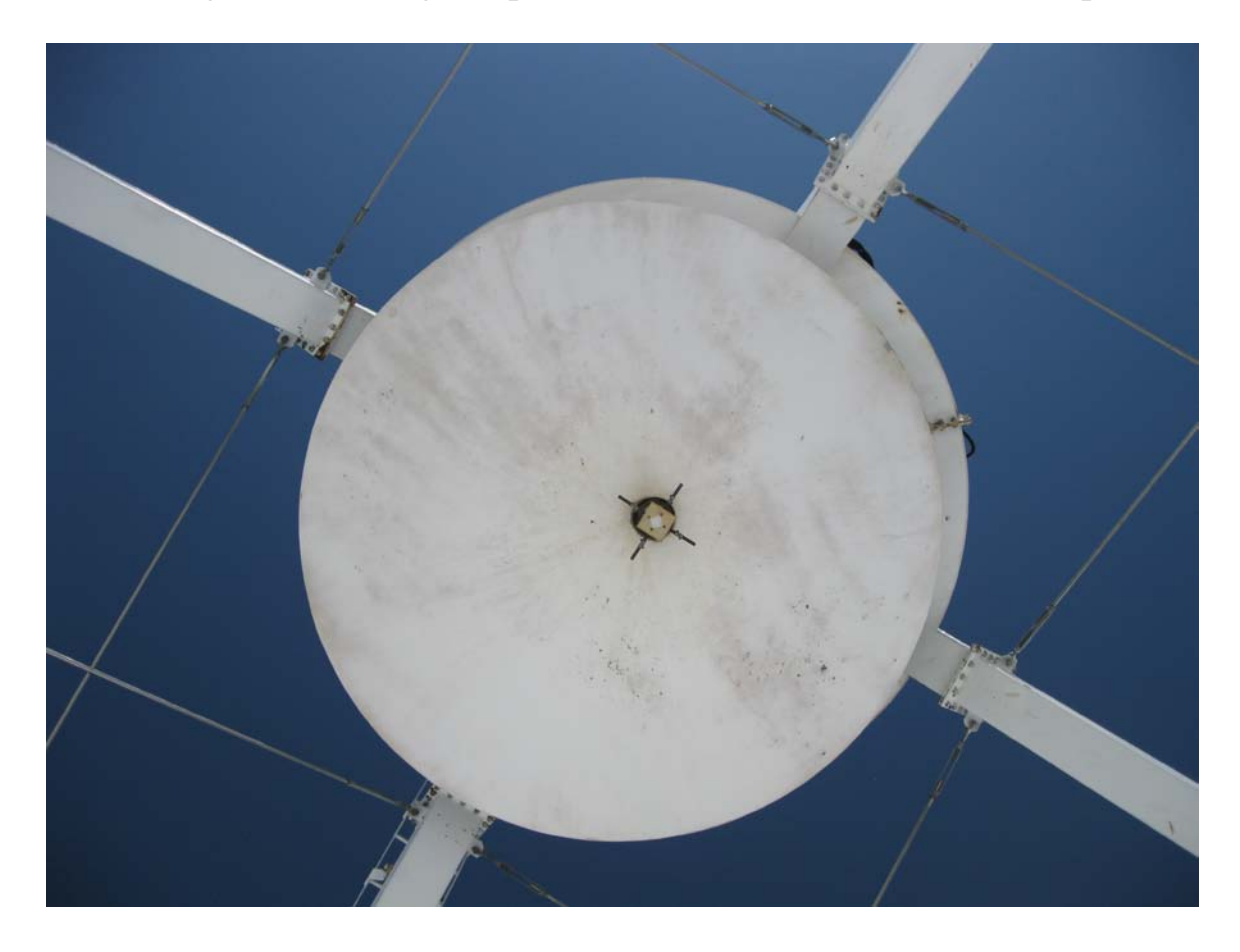
Sub reflector is in good condition.