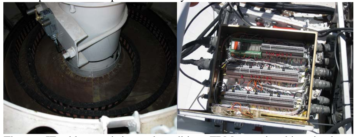
The new IF cable wrap is in good condition. FRM apex signal junction box and cables are in good condition.

Azimuth #1 motor was replaced. The Ellipsoid reflector is in good condition. The ellipsoid actuator operates correctly.