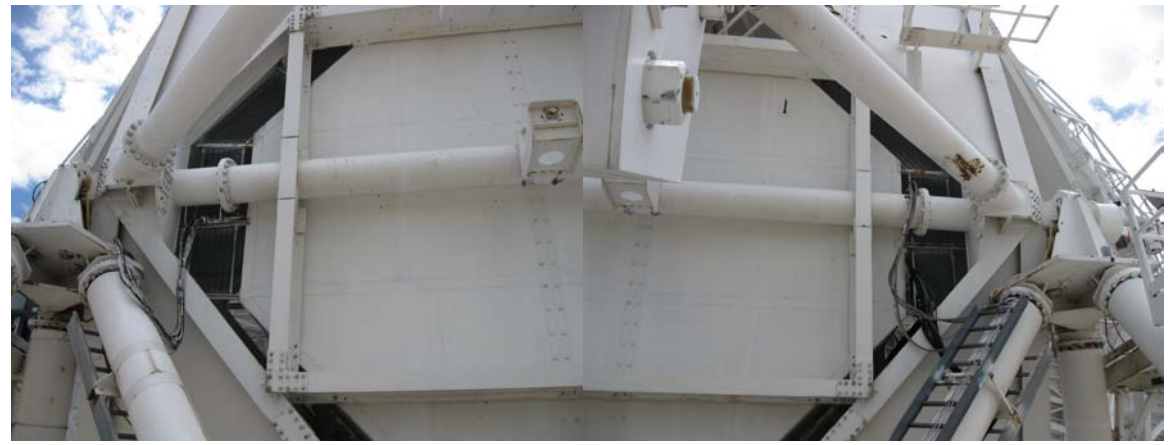
Elevation axle has no visible signs of cracks. Paint is in good condition.