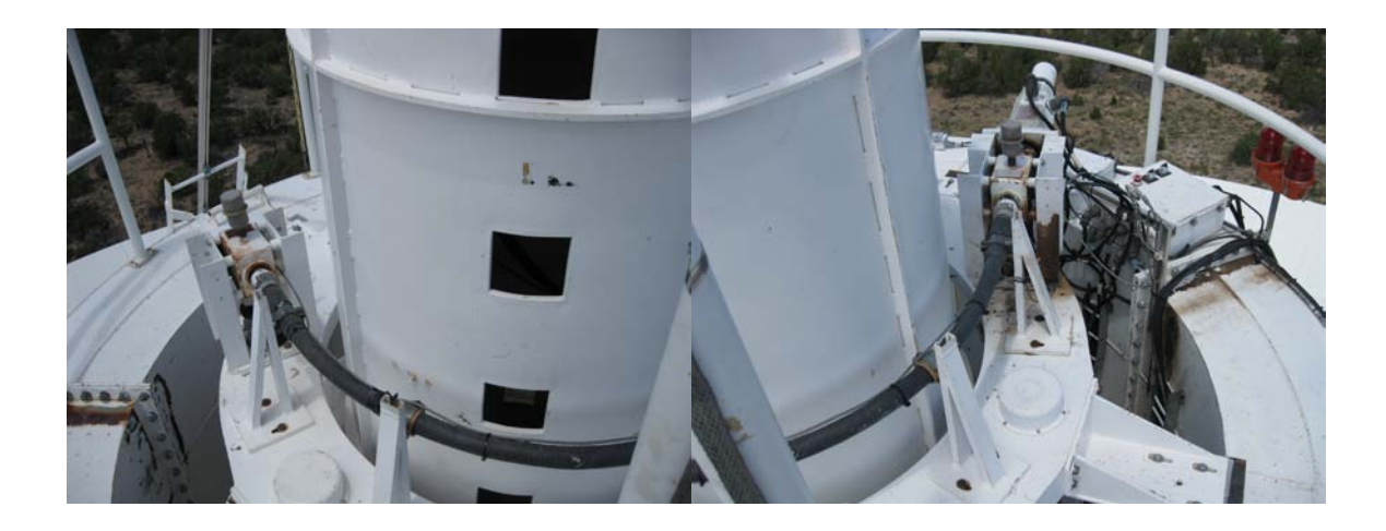
FRM was given a thorough inspection and the focus flex shaft was replaced.