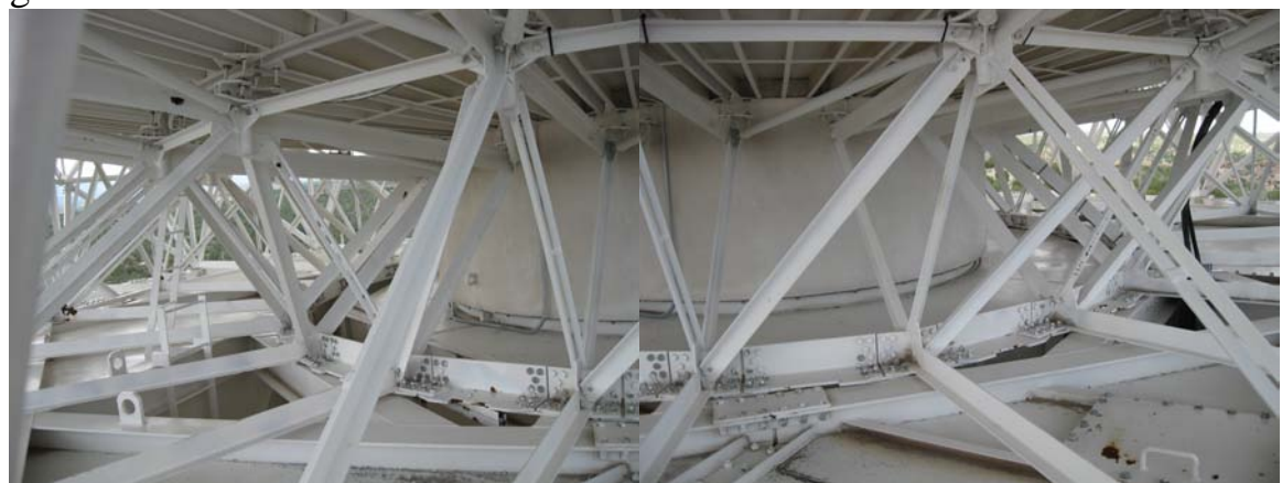
Antenna backup structure is in good condition. Paint is in good condition.