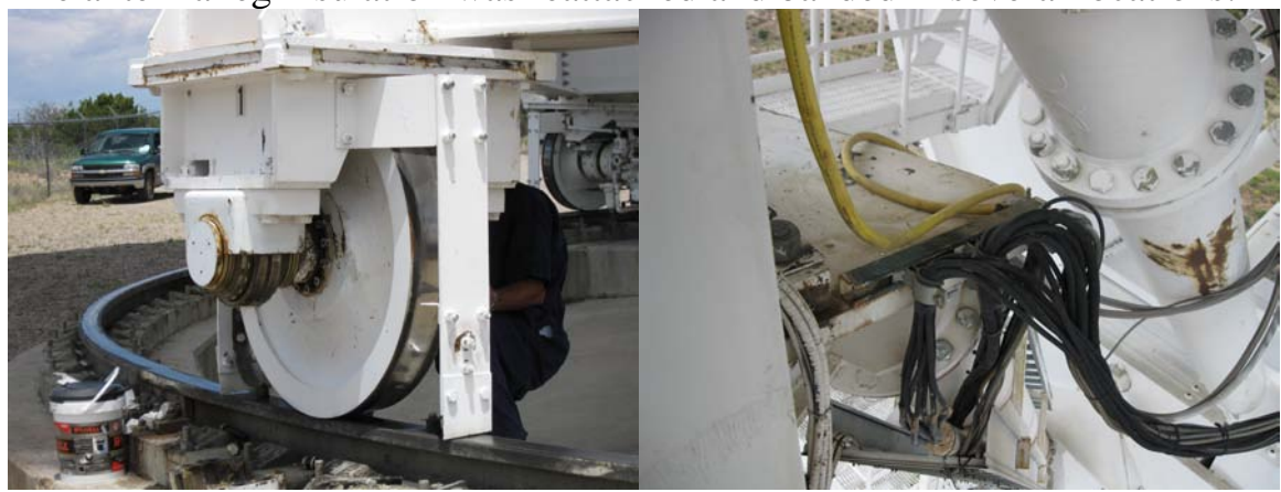
AZ and EL bearings were inspected. Both Elevation cable wraps are in good condition.