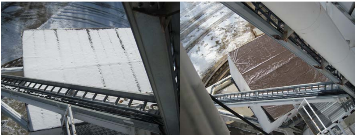
The antenna pedestal room roof has deteriorated so much that the site technicians attached a tarp to keep moisture from leaking into the Servo and FRM electronics. This roof needs replaced ASAP.