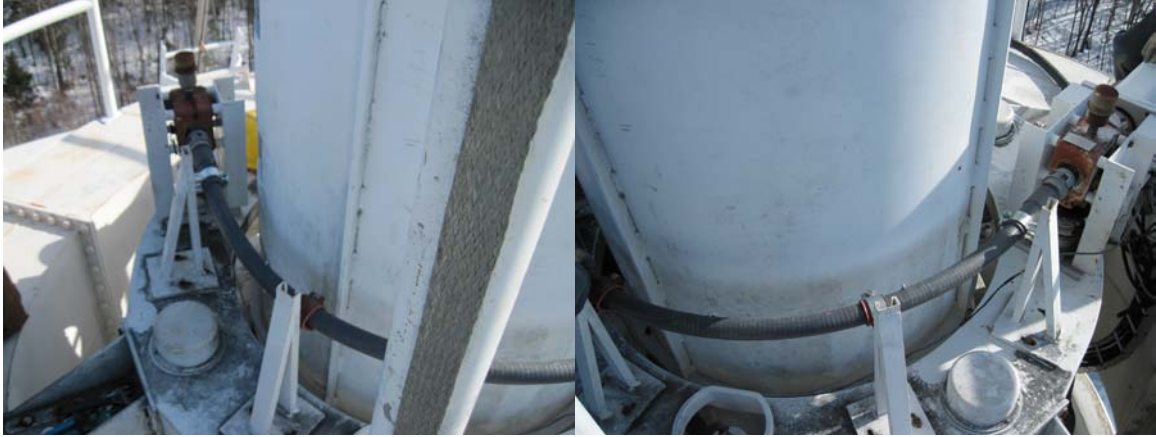
The FRM was given thorough inspection and the focus flex shaft was replaced. FRM is very well lubricated.