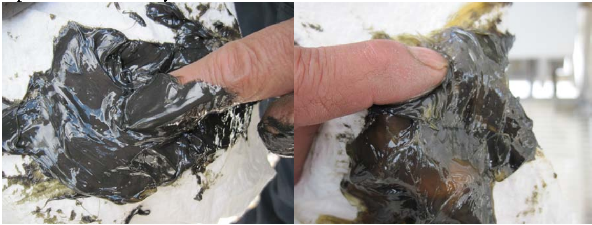
A grease inspection of the synchro and encoder elevation bearings revealed small brass and steel particles in both bearings