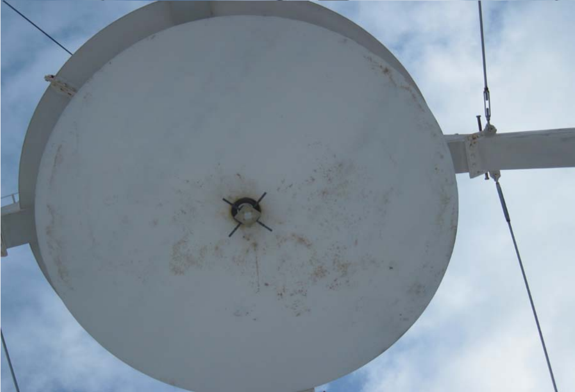
The Sub Reflector is in good condition.