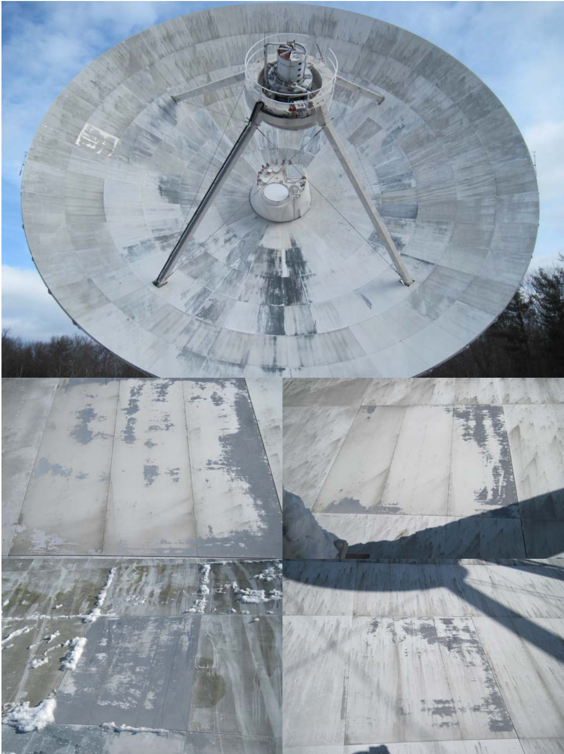
Paint is deteriorating on a few dish panels. All dish panels are stained with mold.