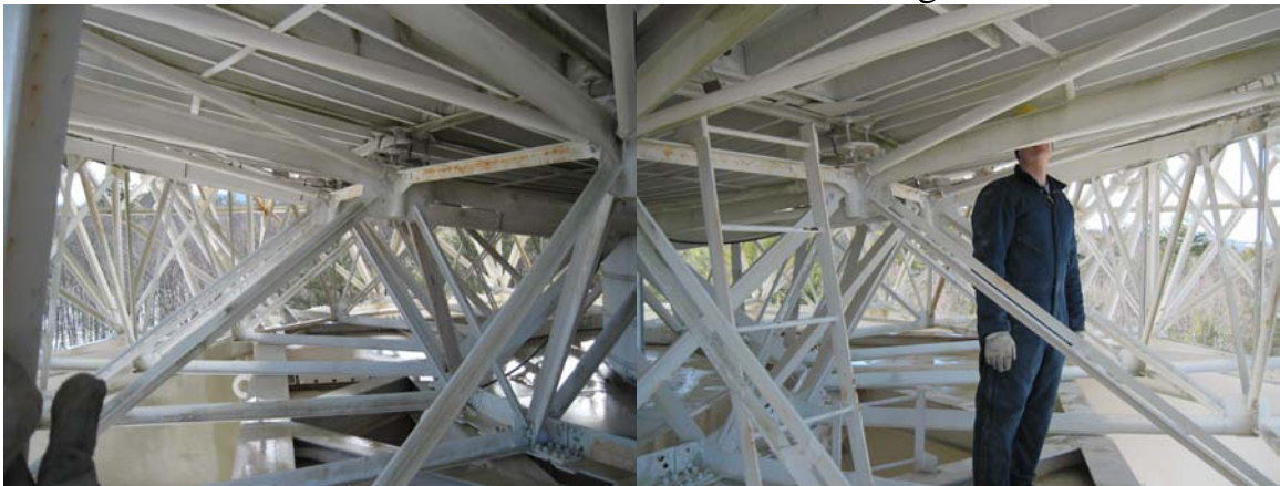
Antenna backup structure is in good condition. Paint is in fair condition with lots of surface rust.