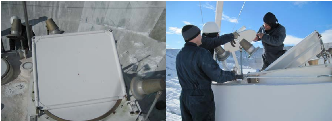
The Dichroic reflector was replaced. The Ellipsoid reflector needed realignment. Ellipsoid actuator operates correctly and is good condition.