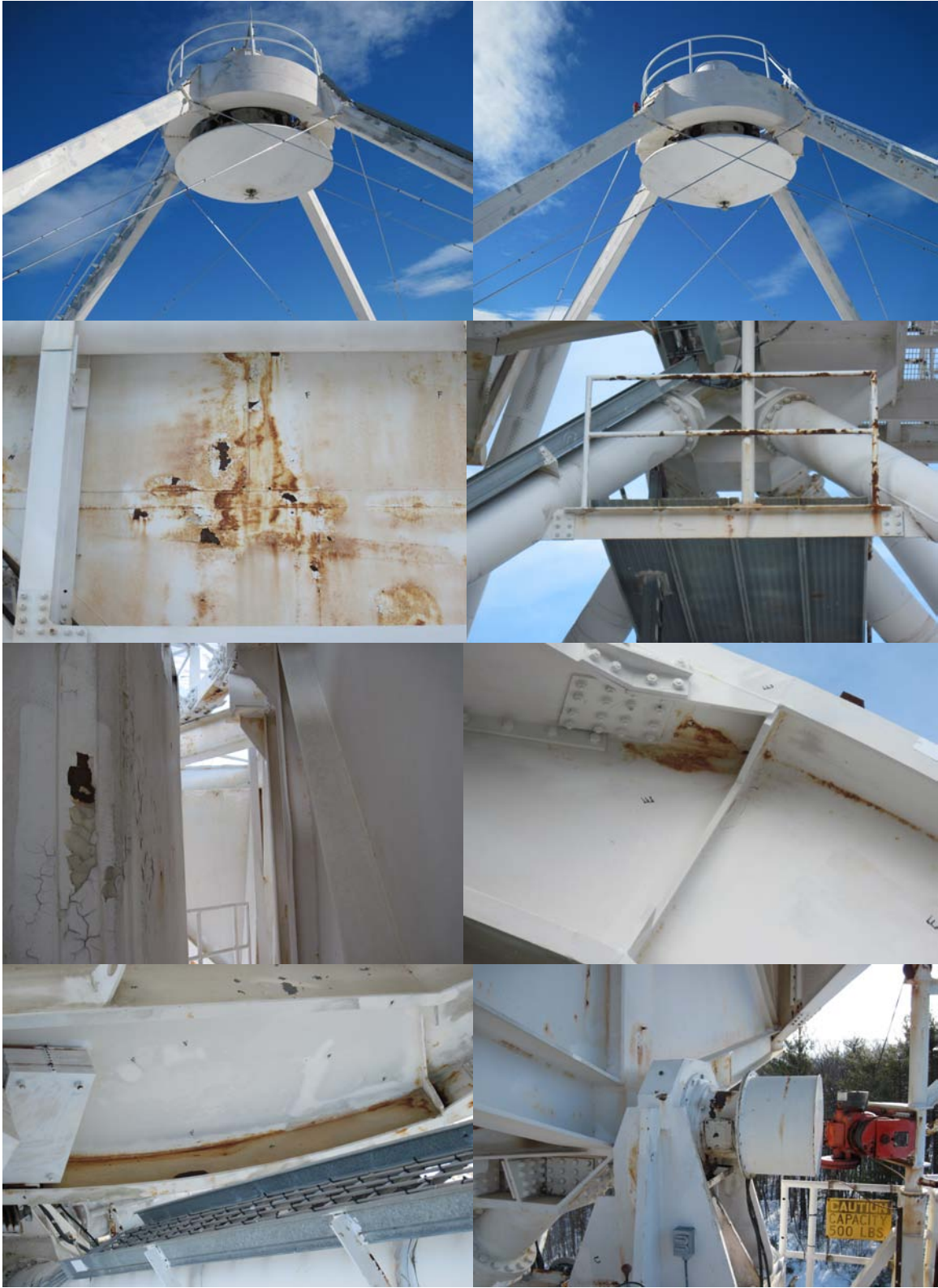
Antenna paint condition is fair to poor, with allot of surface rust.