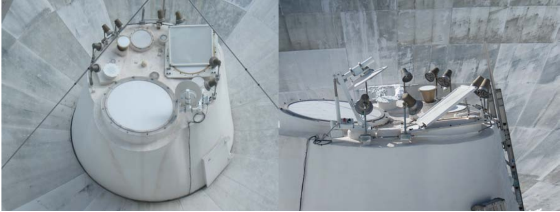
Feed cone feed heaters and FE windows are in good condition.