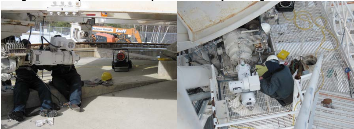
Azimuth #2 motor and Elevation # 1 motor were replaced.