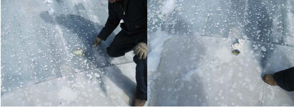
Simple Green cleaner is very effective removing mold off the dish panels.