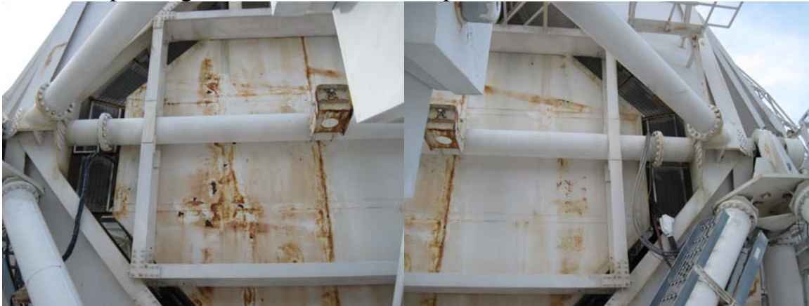
Elevation axle has no visible signs of cracks. Paint is in poor condition with lots of surface rust eating through it.