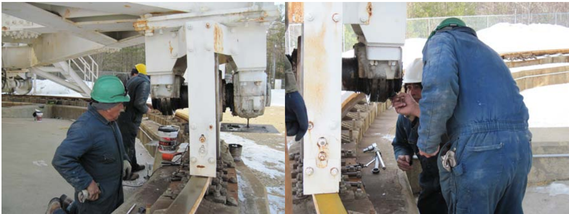
No Azimuth idler wheel bearings needed replacement.