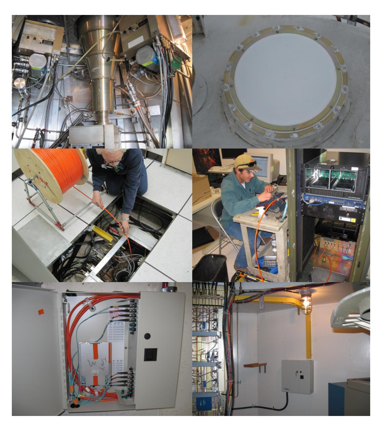
The C-Band Feed and Fiber installation was completed.