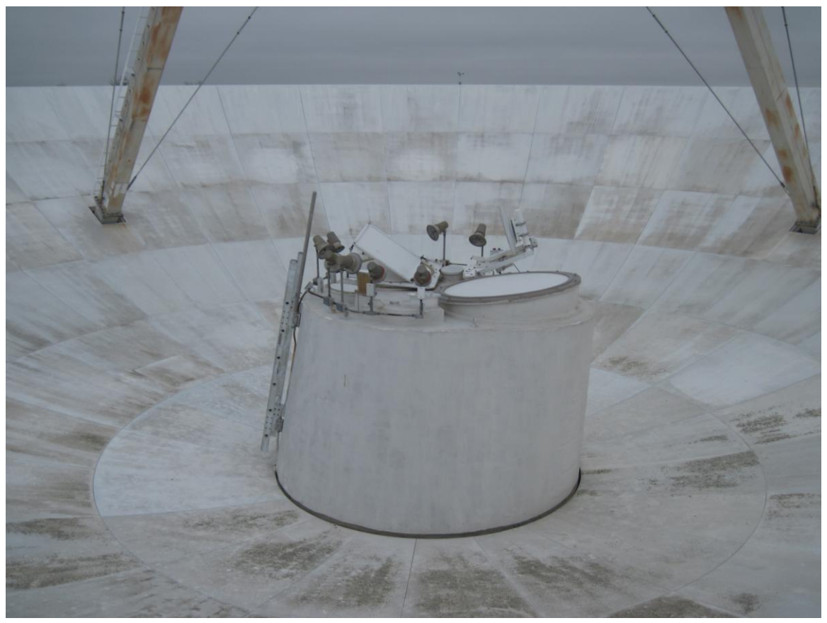
Dish panels are in good condition. The feed cone's elastomeric paint is holding up well. The feed cone was sealed and painted back in 9/2003.