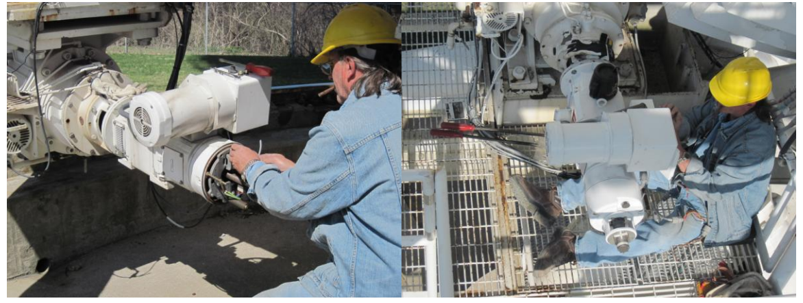
Azimuth motor #1 and Elevation motor #2 were replaced and tested.