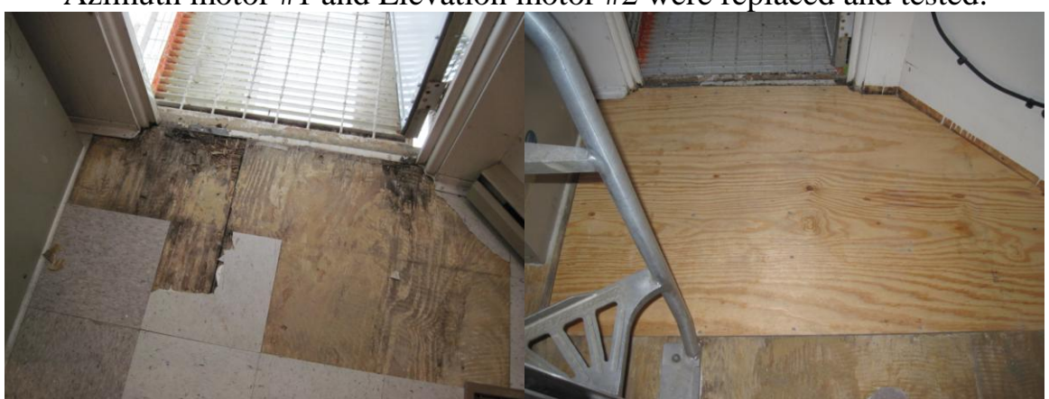
The Vertex room floor was severely rotted and had to be replaced.