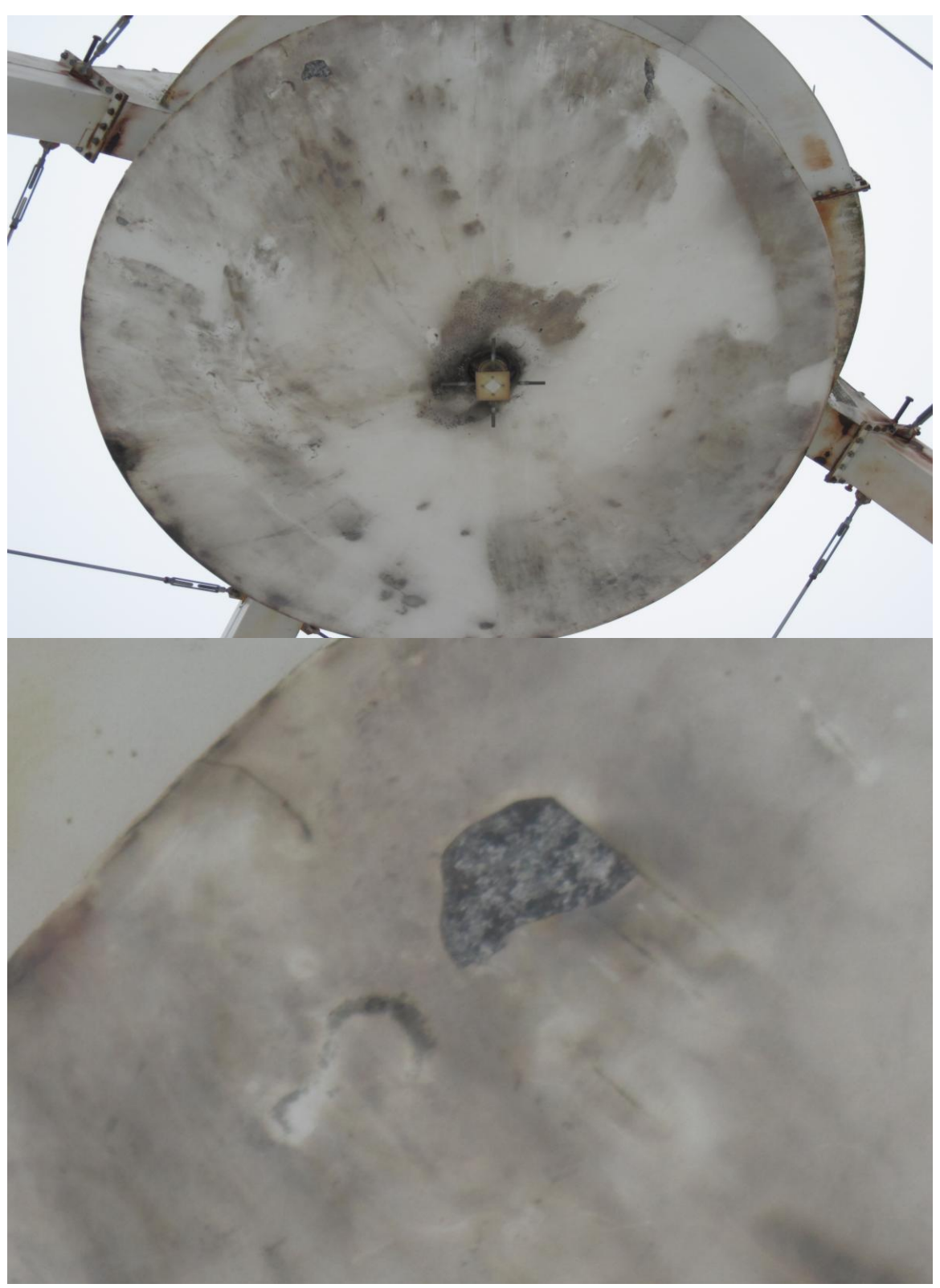
Sub reflector paint is beginning to flake off. FRM was given a thorough inspection. The focus flex was replaced. The FRM is well lubricated. Page 2