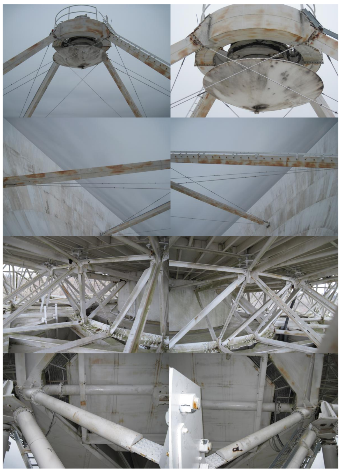
The Antenna needs some "spot painting" or a complete paint job. Paint is flaking off and surface rust is affecting most areas of the Antenna structure. Page 5