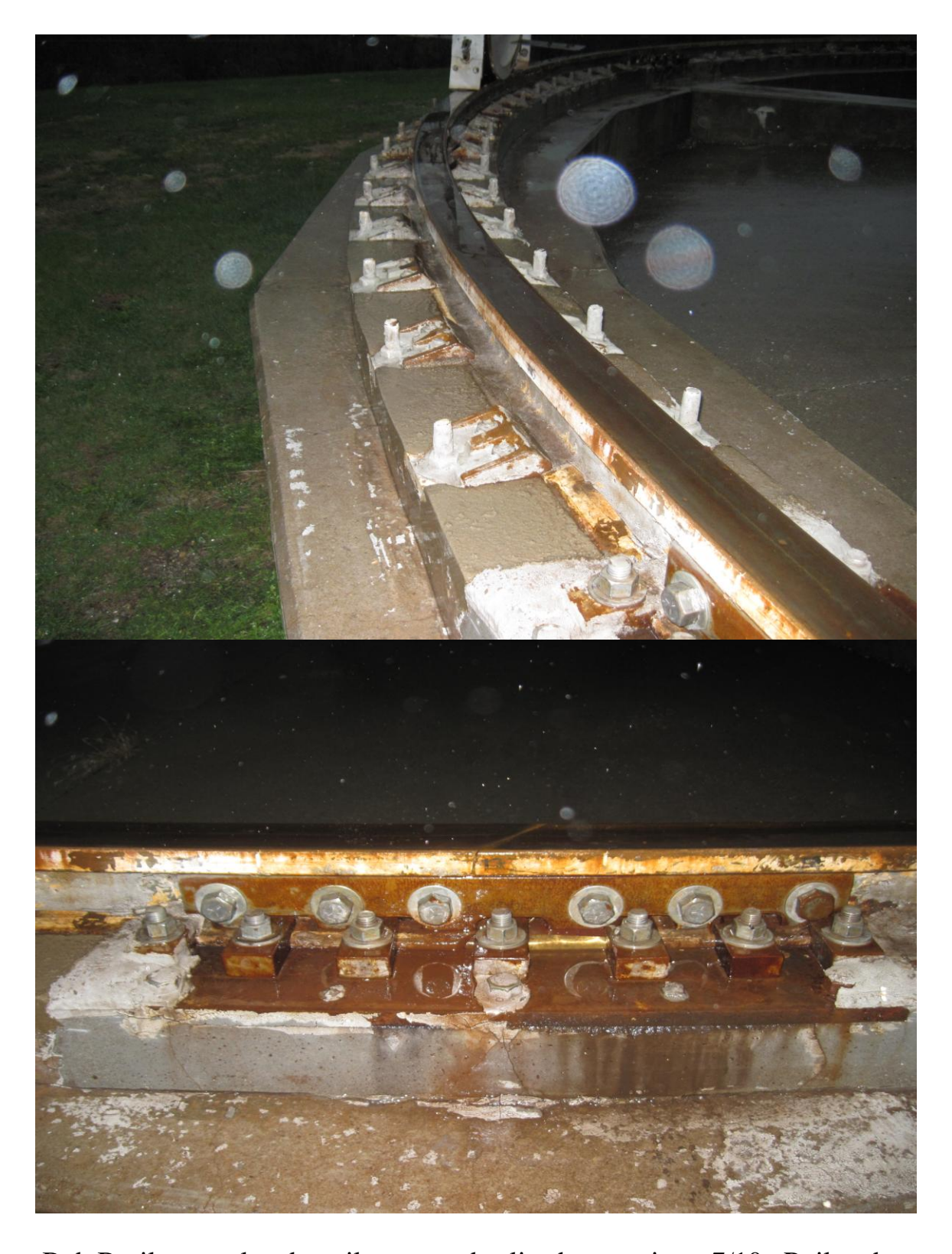
Bob Broilo completed a rail grout and splice bar repair on 7/10. Rail and grout is in great condition. Page 7