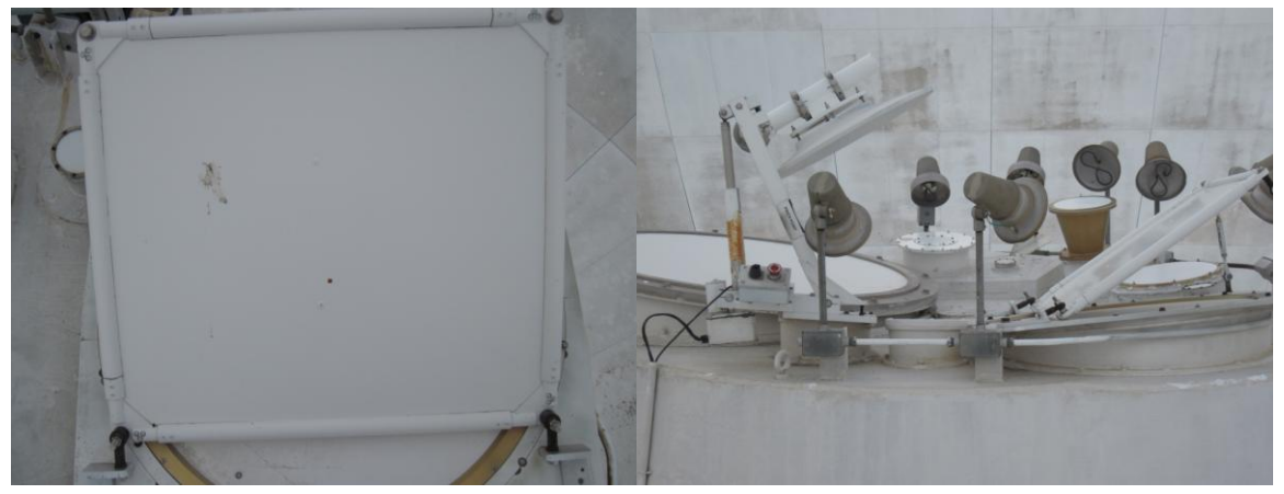
Dichroic reflector is in good condition. Ellipsoid reflector is in good condition. Dichroic reflector actuator operates correctly.