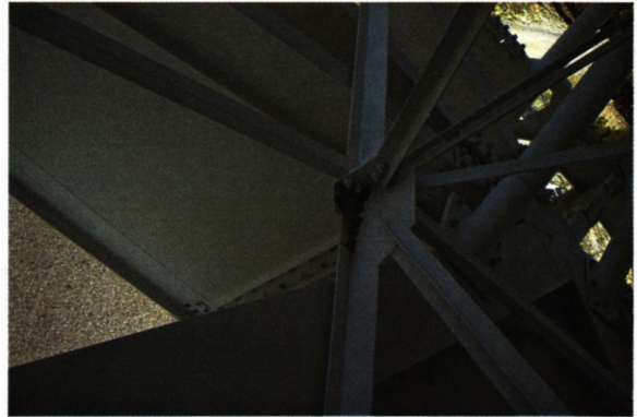
Figure 10: BUS