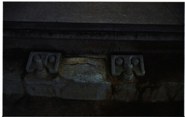
Figure 6: More bad grout