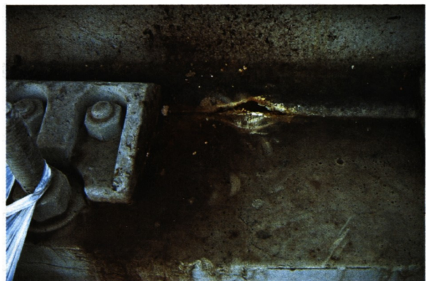
Figure 4: Grout failing under Vulkem