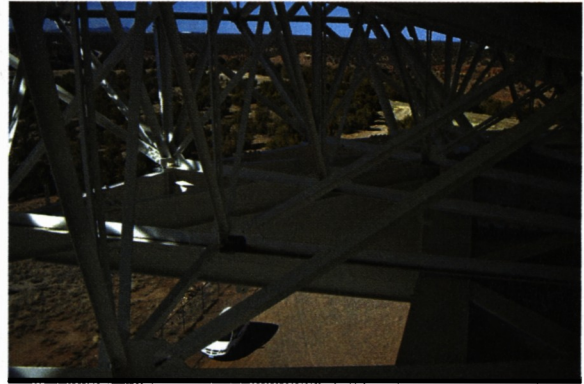
Figure 8: BUS