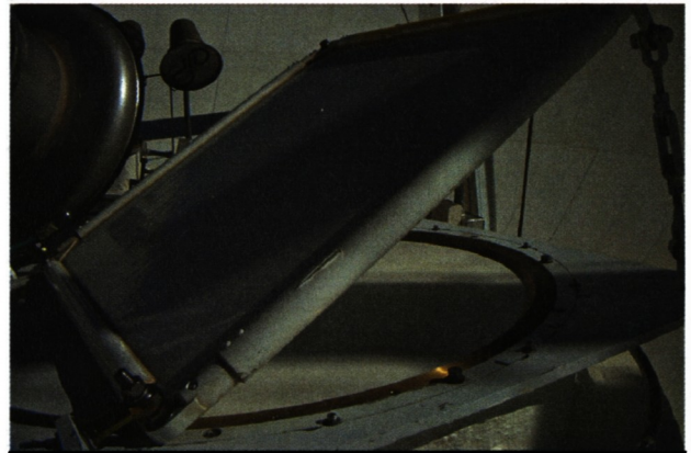
Figure 2 : Dichroic Panel

The azimuth rail grout is bad in several places. The areas that were previously patched with epoxy grout appear to be holding up well. More patching is called for. (Figures 3 through 6)