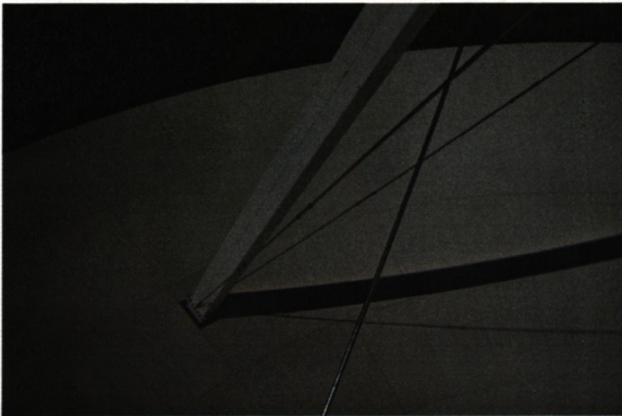
Figure 9: Quad leg & dish