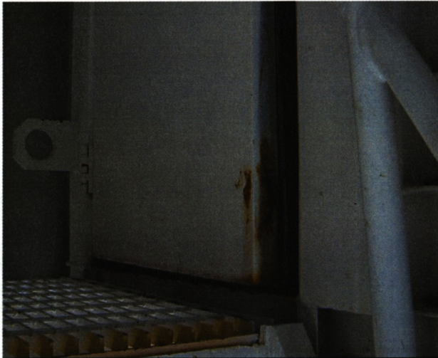
Figure 1: Vertex house door

The dichroic panel is in good condition. (Figure 2)