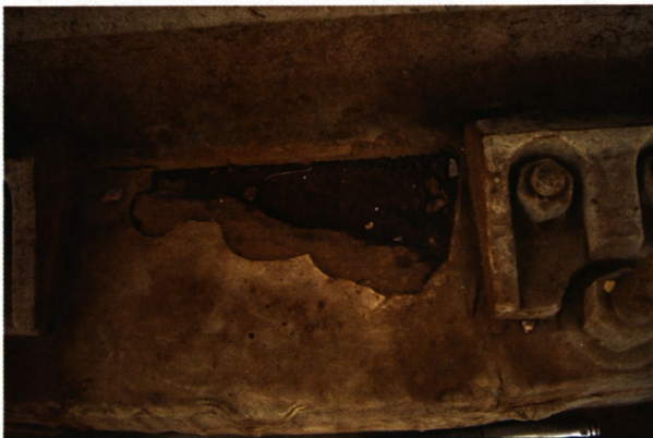
Figure 3: Bad grout

The azimuth rail grout is bad in several places. The areas that were previously patched with epoxy grout appear to be holding up well. More patching is called for. (Figures 3 through 6)