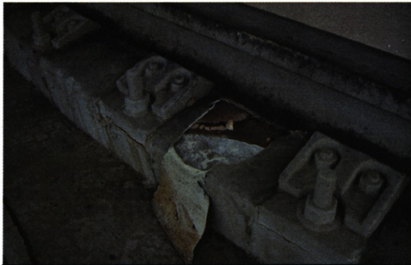
Figure 5: More bad grout