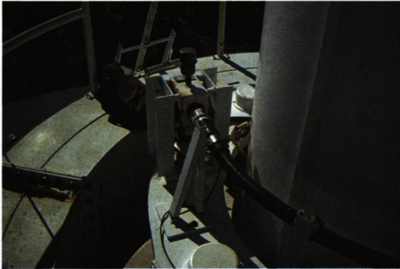
Figure 7: Apex

The paint on this antenna is in excellent condition. (Figures 7 through 10) We did some touch up painting around the mid-level handrails, pedestal structure, and the elevation bearing that was changed last January.