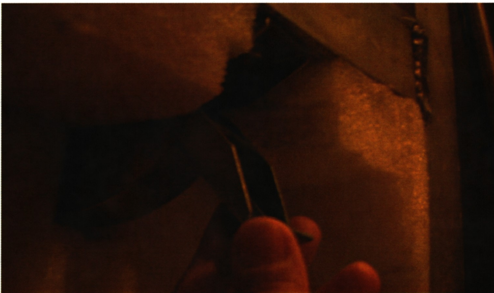
Figure 12: New vertex room latch

A modified Southco #9770-220-11 latch was tried out for the vertex room hatch. It worked well, so more have been ordered and we will begin replacing broken rubber latches with these. (Figure 12)