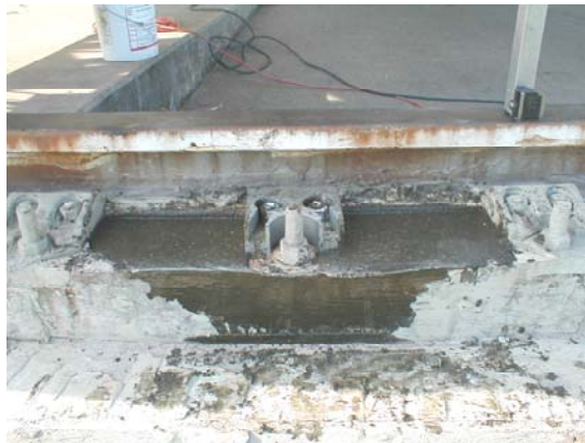
Figure 6. Typical spot repair with rail clip bolts replaced.