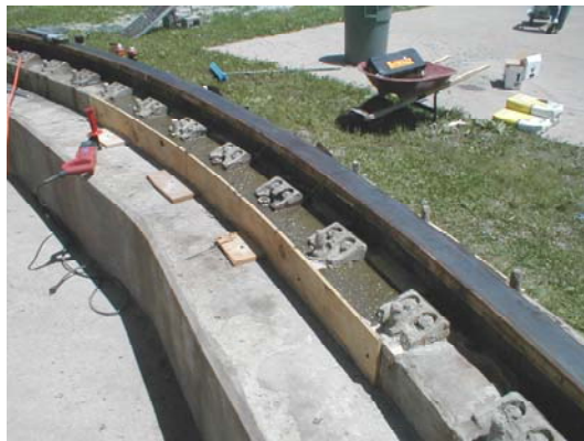
Figure 4. Rail section near bolt 13 repaired with high strength epoxy grout.