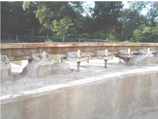
Figure 3. Rail section with grout removed.