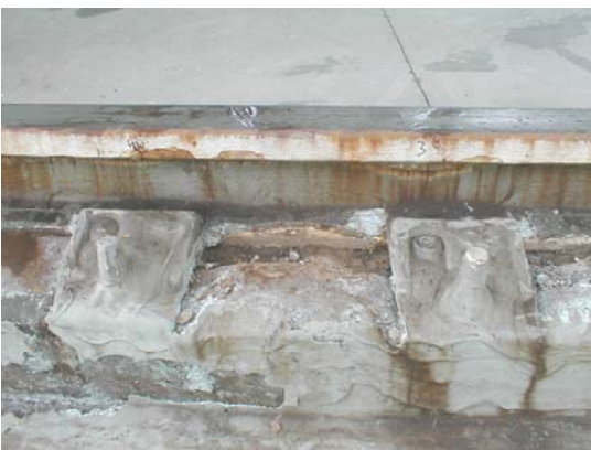
Figure 5. Candidate for spot repair.