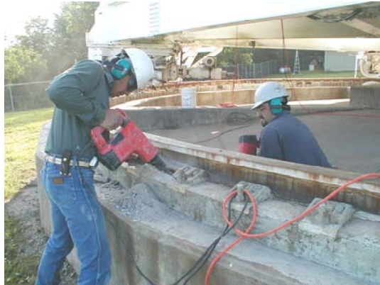
Figure 2. Hammer drills used to remove old grout.