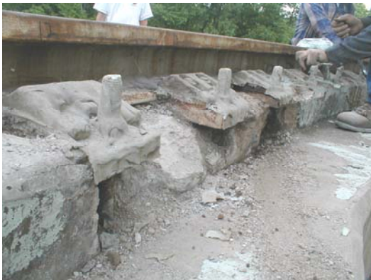
Figure 1. Degraded grout near bolt #13.