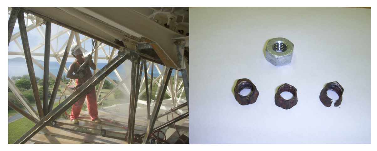
Figures 1a, 1b: Sandblast preparation of the St. Croix VLBA antenna (L). Corroded backup-structure nuts, replaced as part of the 2007 overhaul.